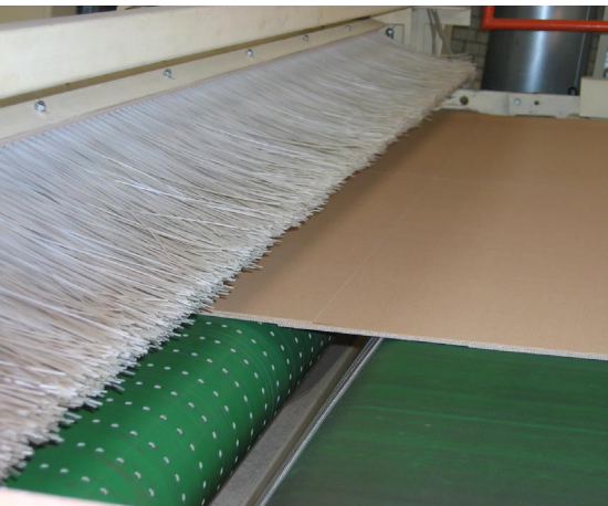
Full width vacuum belt with brushes